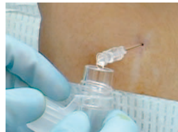
Collection of CSF

CSF will drip into the collection tubes; it should never be aspirated because even a small amount of negative pressure can precipitate a hemorrhage. The amount of fluid collected should be limited to the smallest volume necessary — typically, 3 to 4 ml. Fluid should be collected from the manometer if an opening pressure was measured by turning the stopcock toward the patient and draining the fluid into a tube. After collecting an adequate specimen, replace the stylet and remove the needle.